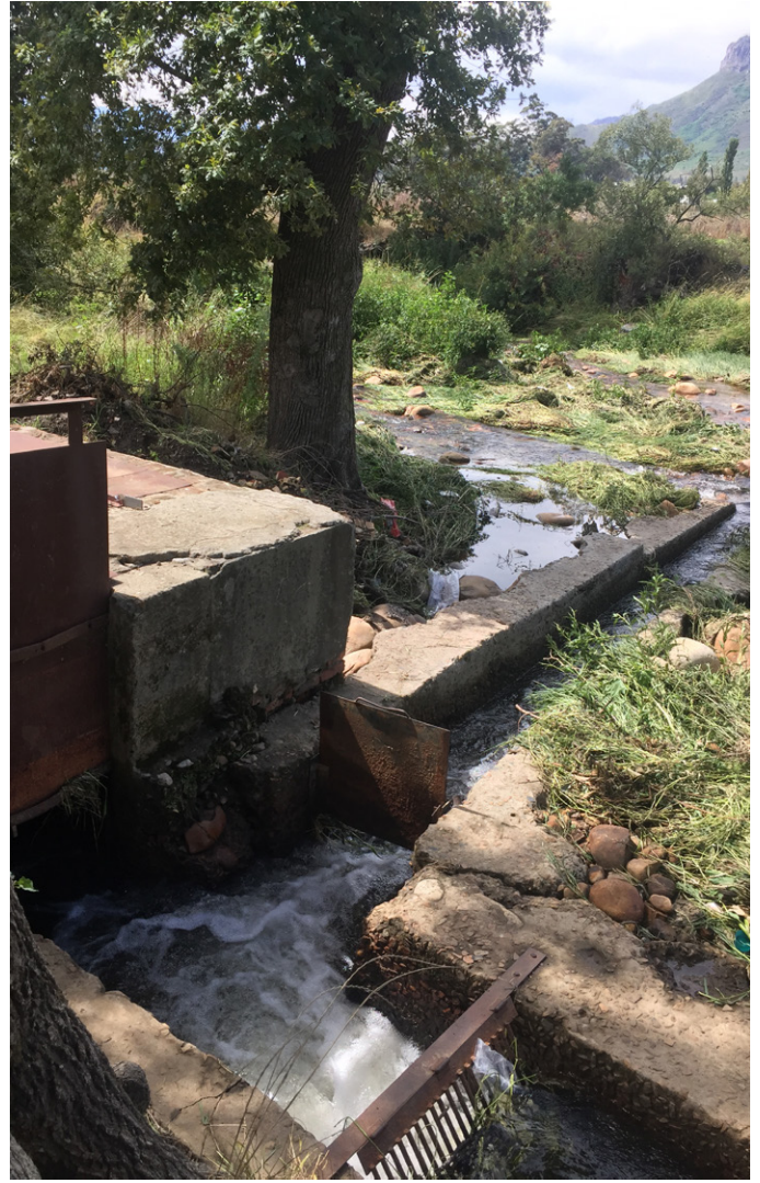
The Dwars River is located in the mountainous parts of the Upper Berg catchment and has been intensively farmed for almost 400 years, and is currently an important agricultural catchment, particularly for viticulture. Landcover is therefore highly transformed, and the hydrology of the system is altered by an inter-basin transfer, and there is much abstraction from the river, some legal and some illegal -like this sluice pictured here.