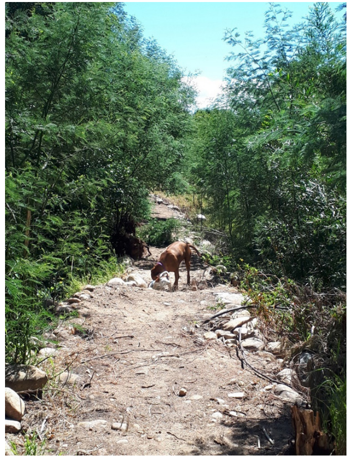
Dense infestations of Black Wattle ( Acacia mearnsii ), Black Alder and poplars cover the disturbed and degraded banks of the Dwars River, Western Cape, South Africa.

logically inviable manner (e.g. tackling dense infestations of invasive alien trees first, and the lower reaches of the river) risks compromising project success in the long term. This is especially in the context of extremely insecure funding for the medium to long-term and the unreliability of these funds, where having secure funding for follow-ups in this area, at least for the next 30 years, is essential.