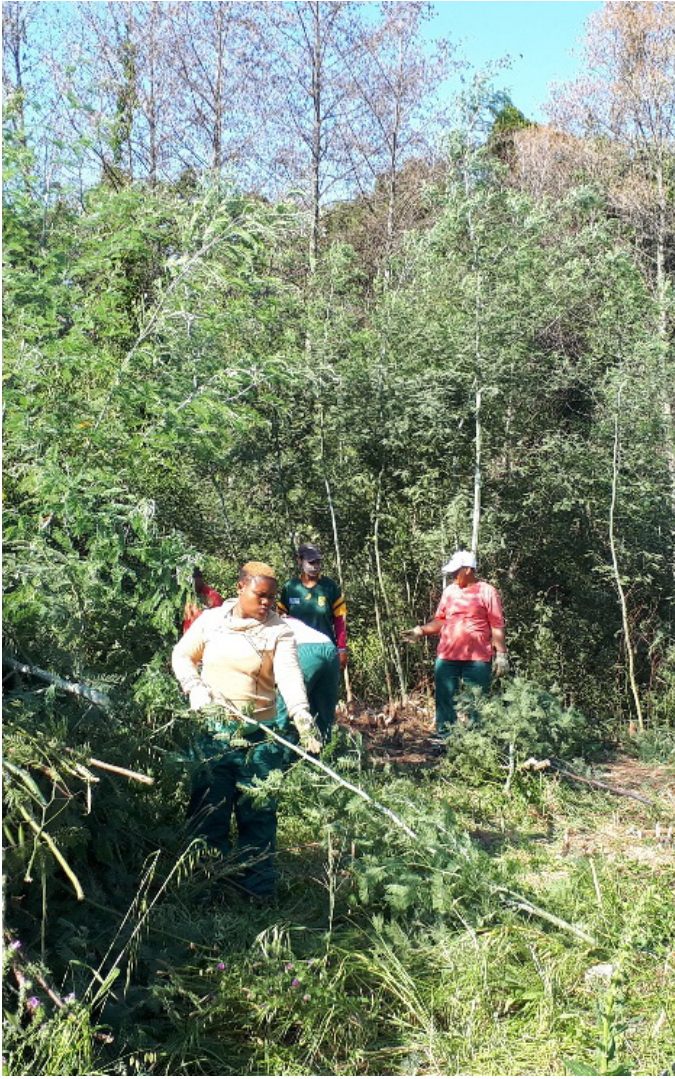
Working for Water teams in operation. Working for Water is part of the Expanded Public Works Programme (EPWP) funded by National Treasury to create jobs).