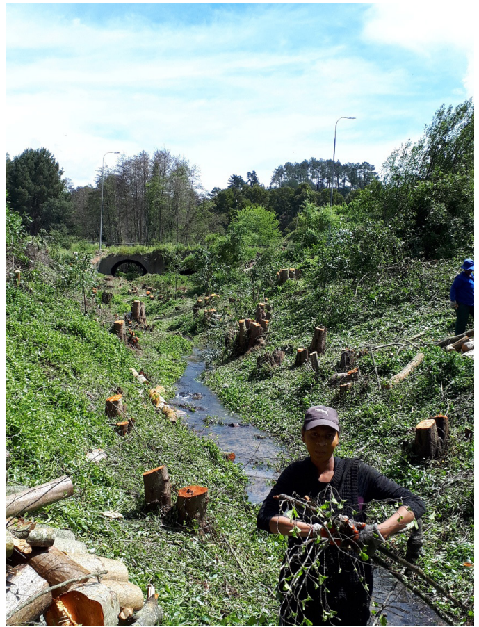
Working for Water teams (under the implementing agent: Wildlands Trust) clear foliage following logging operations of mature alien trees in the riparian zone.

ecosystems identified through this research: (1) that alien trees are valuable in soil retention and erosion prevention, and (2) that alien trees combat global warming by sequestering carbon. Many invasive alien trees outcompete indigenous flora, and due to competitive advantage and lack of pests, form closed canopy systems which result in little to no vegetative ground cover. The lack of cover results in soil loss and erosion. People perceive trees to be “holding onto the soil” because their roots become exposed through erosion, creating the impression that the trees hold back the soil, when the opposite is the case. In terms of the carbon sequestration ability of alien trees in fire-prone ecosystems, due to regular fires burning above ground biomass, any sequestration will need to be taking place below ground. The native fynbos, with its resprouters and rich geophytes and bulbs, are thought to store far more carbon below ground than invasive alien trees, as well as trap more